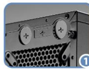
Support water-cooling pipe.