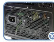
PSU in the bottom—Keeps chassis not only steady, without shaking, but also provide better air flow for PSU.