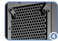
Rear ventilation opening—Can assemble 9, 12cm fan.