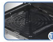
PSU dust prevention net—To prevent dust from entering the case (Optional). Can assemble 9, 12, 14cm fan.