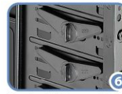
Screwless ODD—To assemble ODD easily.