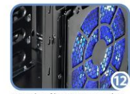
Front dust filter—To prevent dust from entering case (Optional). Can assemble 9, 12, 14cm fan.