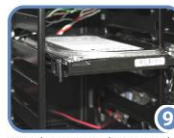
Screwless HDD track—To assemble HDD easily.