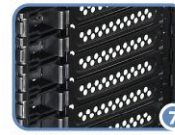
Mesh PCI Slot—With better ventilation, can support screwless PCI device and easy to assemble.